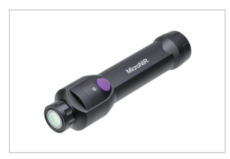
MicroNIR OnSite-W Instrument

The MicroNIR OnSite-W is the smallest fully-integrated NIR spectrometer on the market and is enabled by proven VIAVI linear variable filter (LVF) technology. With no moving parts and IP65/IP67 dust/water ingress rating, it is designed for a wide range of material characterization applications in food, agriculture, pharmaceutical, and security markets.