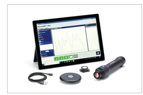
MicroNIR OnSite-W Kit running MicroNIR Pro application (tablet not included)